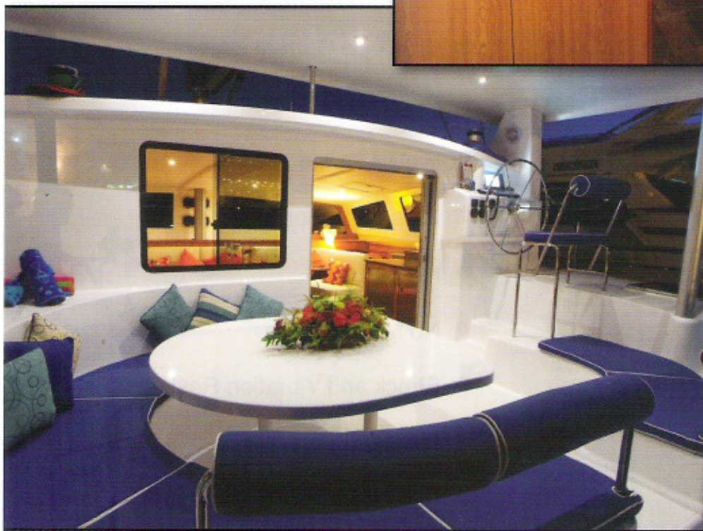
The cockpit is a great area for alfresco dining, or simply relaxing.

Stepping down into the hulls, the first has double master cabins forward with their double beds slightly angled and with access on both sides. These are not bunks, but proper beds like you would find in a five-star hotel. Each master suite has its own bathroom forward, with a large shower and electric toilets. It's simple, it's elegant and the quality is superb. You can also order the Vision 450 in a 3-cabin