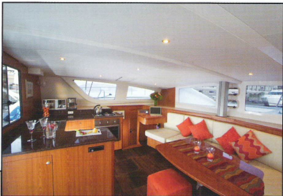
The main saloon has a full width settee.

Entering through a large double door that slides away into its own storage area, the main saloon has a full width settee and large table to retreat to if the local tropical mosquitoes decide that you are on the menu. There is a separate fridge freezer