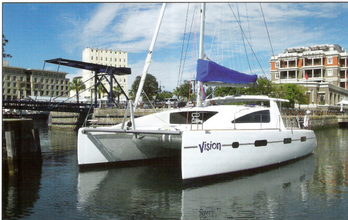
The Matrix Yacht's Vision 450 has unique styling and unrivalled luxury.