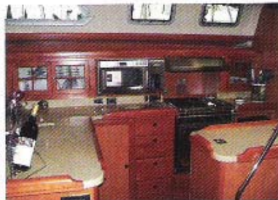
The Hunter 49's galley is great for entertaining and has the storage to accommodate everything!

So, after all of that, what could possi-