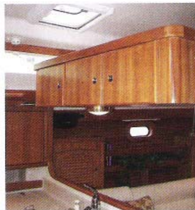
The Catalina 470's galley is efficient and attractive with fantastic natural and artificial lighting.

bly be at the top of my list? It was the first boat that I stepped on to that day – the Catalina 470. The flow of the galley, storage, access to the fridge from top and side and the proximity to your guests, both above and below decks was fantastic. A lot of thought went into making sure you could secure your wares; pegs to hold in any size of plate/bowl and well-located wire shelving in many cupboards help