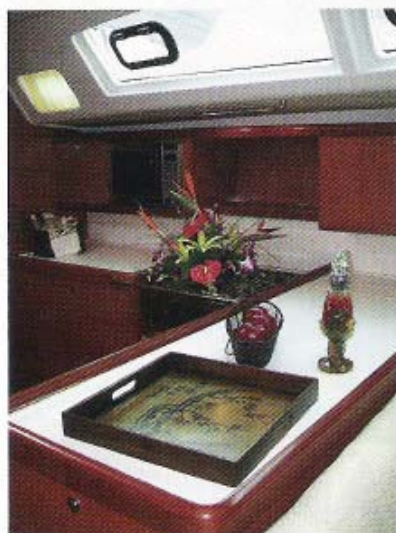
The Beneteau 49 has a beautiful and spacious modern galley with great natural lighting.

The Wauquiez was set up similarly, although it, too, was beautiful and both boats offer a lot of storage and counter space. If you ever get a chance to see the Jeanneau 45DS, check out the wine/liquor bottle storage (that's all I'll say). All of the boats had some great galley features. Just bear in mind that I was only on these boats for a short time (slightly longer if they had the A/C turned on), and could not actually try