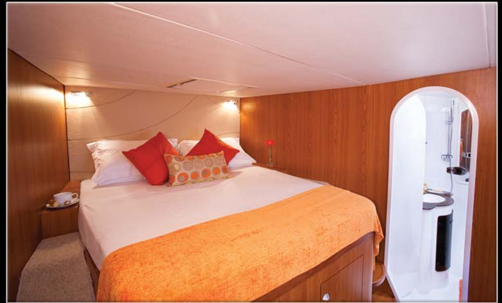
Latest generation catamaran